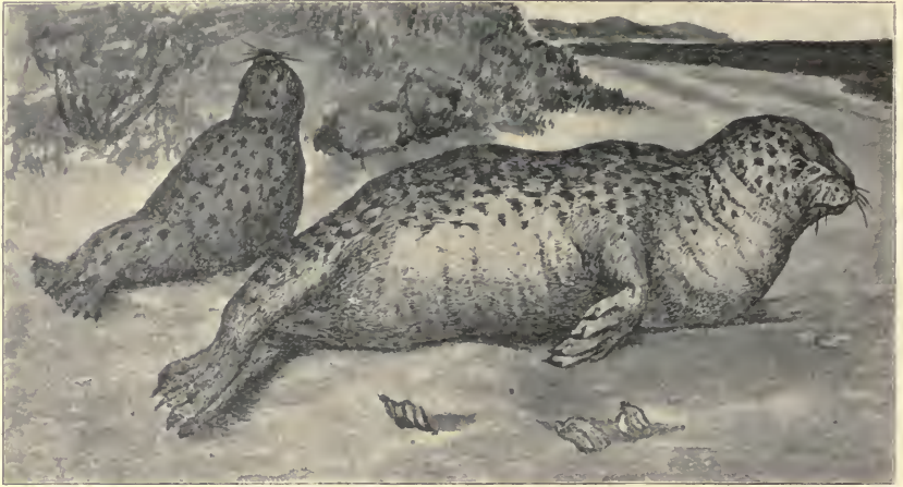
FIG. LXI. PHOCA RICHARDI. RICHARD'S HARBOR SEAL.